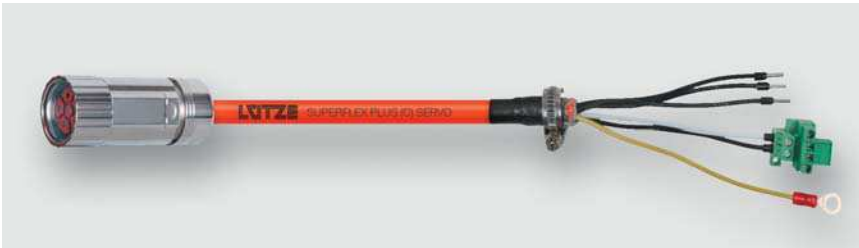
Servo cable assemblies with brake pairs for C-tracks