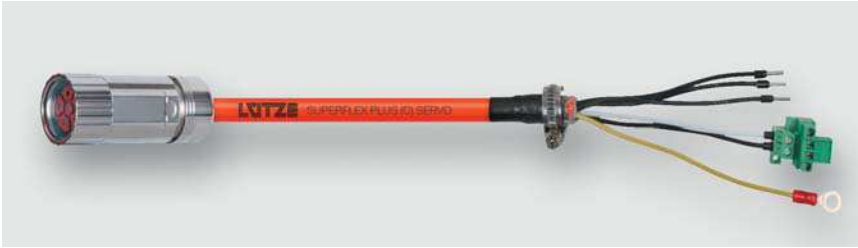
Servo cable assemblies with brake pairs for C-tracks