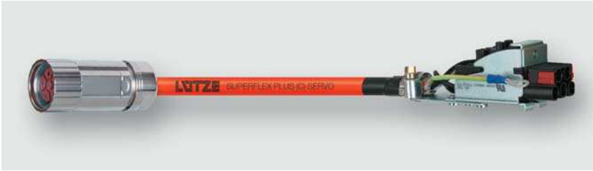
Servo cable assemblies with bra- ke pairs for C-tracks