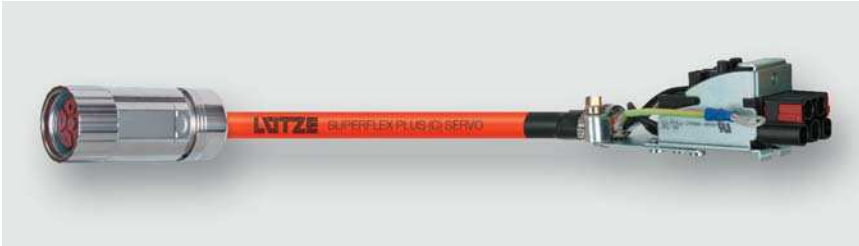
Servo cable assemblies with bra- ke pairs for C-tracks