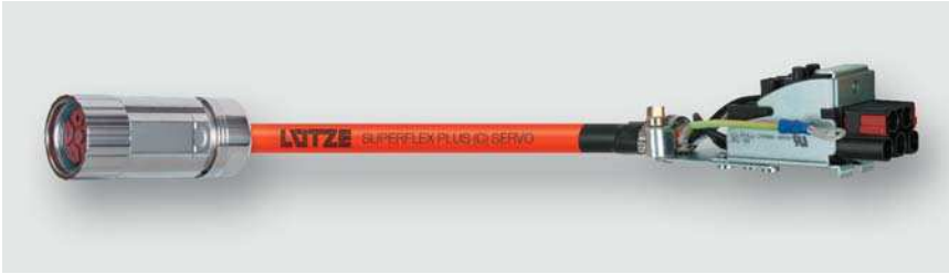
Servo cable assemblies with bra- ke pairs for C-tracks