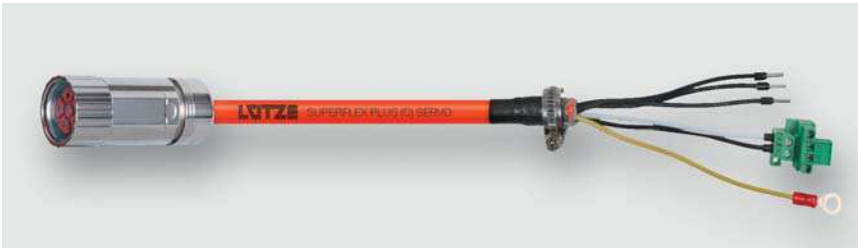
Servo cable assemblies with brake pairs for C-tracks