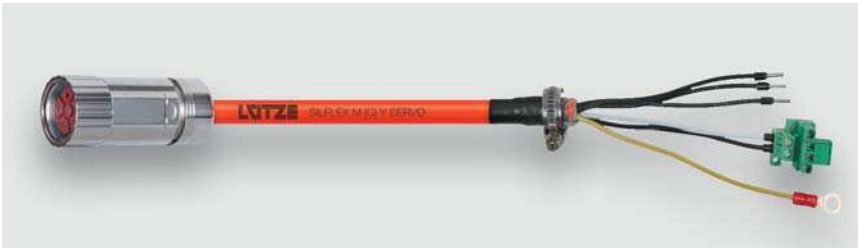
Servo cable assemblies with bra- ke pairs for fixed installation