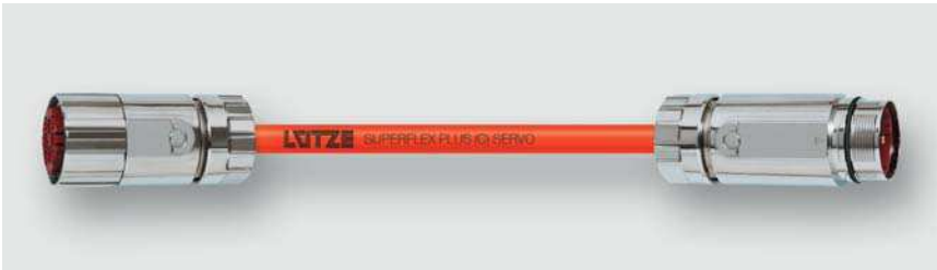
Servo cable assemblies with bra- ke pairs for C-tracks