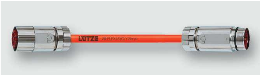
Servo cable assemblies with bra- ke pairs for fixed installation