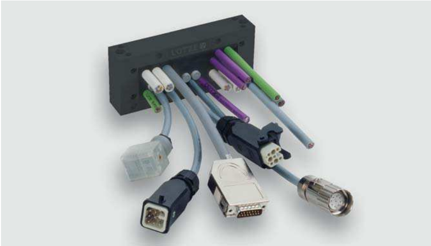
Cable fittings and accessories