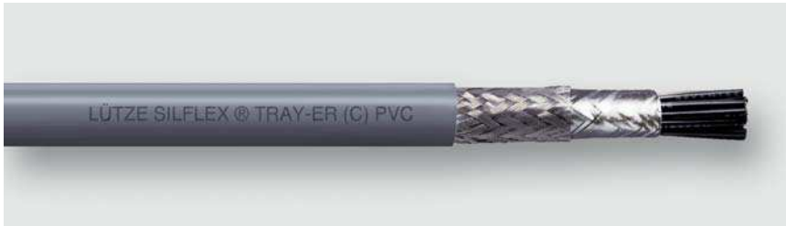
PVC control cables · shielded