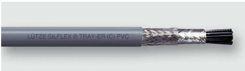
PVC control cables · shielded