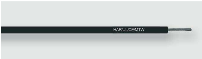
Flexible Single Conductor Hook Up Wire · Multi-Norm