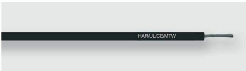
Flexible Single Conductor Hook Up Wire · Multi-Norm