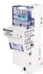
1-Pole with microswitch