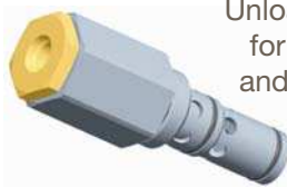
Unloading valve for work ports and two speed winch operation