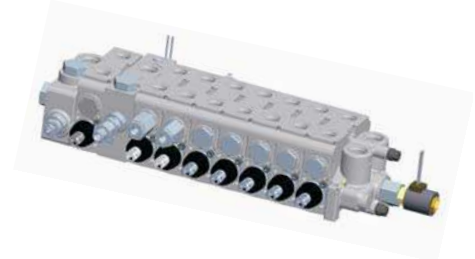
Directional control valve assembly with integrated unloading valves for lift and tele and selectable winch boost