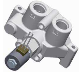
Solenoid selectable power-beyond outlet

Our long standing application knowledge of these machines has enabled Parker to develop features truly valued by the customer and the end-user.