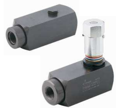
Pressure Compensated Flow Valves

Parker Check Valves have fully guided poppets. Our superior design eliminates wobble and erratic travel that can commonly occur with less durable ball-check type construction. The soft seal poppet on the Check Valves are standard for sizes up to 1/2" NPT, #10 SAE.