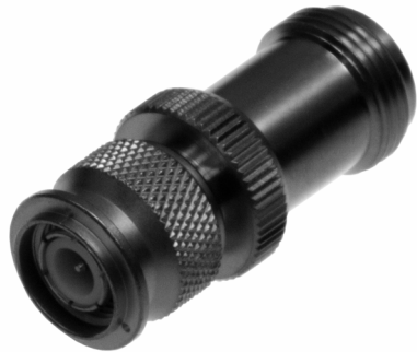
Adapter TNC plug to N socket