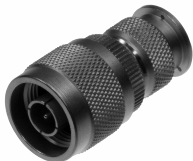
Adapter N plug to TNC plug