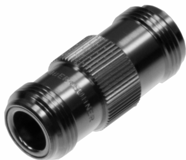
Adapter N socket to N socket