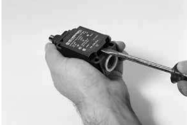
Z/T 336: opening the cover

According to EN 60204-1, the versions with connector must only be used in PELV circuits.