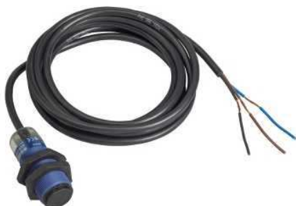
photo-electric sensor - XUB - multi - Sn 0..20m - 12..24VDC - cable 5m