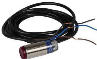
photo-electric sensor - XUB - multi - Sn 0..20m - 12..24VDC - cable 5m