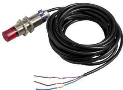
photo-electric sensor - XUB - emitter - 90° - 12..24VDC - cable 5m