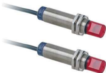
photo-electric sensor - XU2 - thru beam - 90° - Sn 15m - 12..24VDC - cable 2m