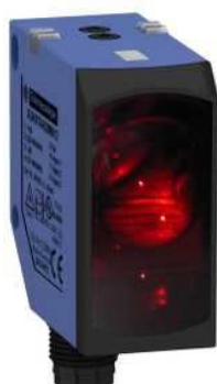
photo-electric laser sensor - XUK - reflex - Sn 70m - 2Q 1Qa 3IN - hoisting app