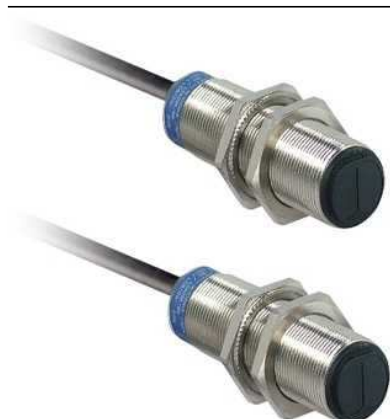
photo-electric sensor - XU2 - thru beam - Sn 15m - 12..24VDC - cable 2m