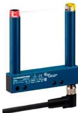
photo-electric sensor - XUV - fork - 80X60mm - 12..24VDC - M8