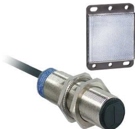
photo-electric sensor - XU1 - reflex - Sn 4m - 12..24VDC - cable 2m