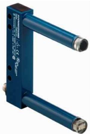
photo-electric sensor - XUV - fork - 50X60mm - 12..24VDC - M8