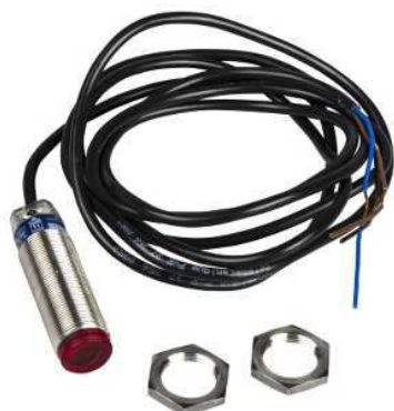
photo-electric sensor - XUBT - polarised - Sn 1.4m - 12..24VDC - cable 2m