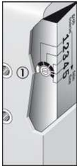
Choice of sensitivity range, dimensions in mm/m (inch)