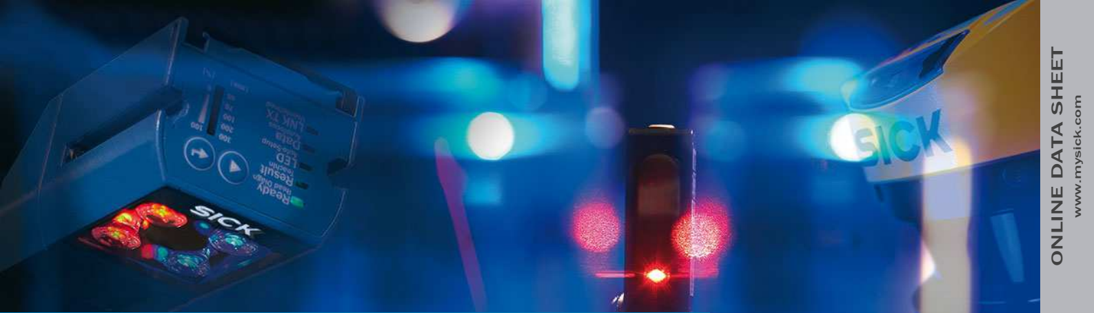
Image-based code readers ICR845-2 / ICR845-2E / Extended Long Range