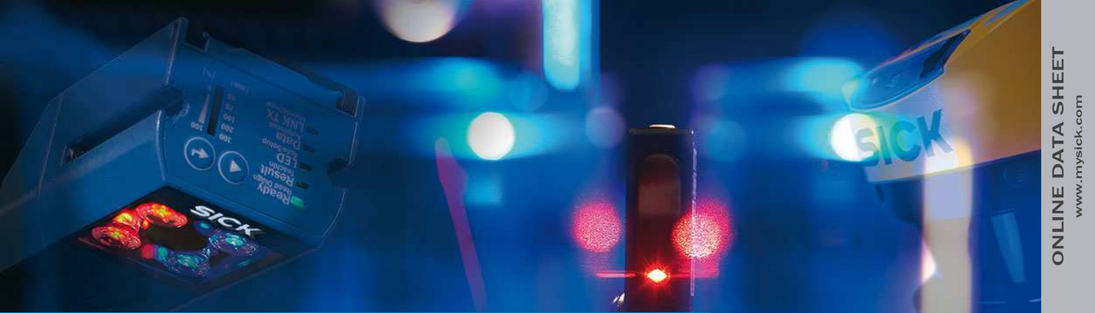
Image-based code readers ICR84x-2 FlexLens / ICR847-2L FlexLens