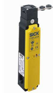
actuator not supplied with delivery

Note: The actuator has to be ordered separately. See "Accessories" for further details.