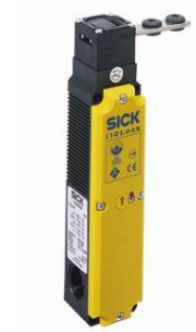
actuator not supplied with delivery

Note: The actuator has to be ordered separately. See "Accessories" for further details.