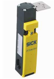
actuator not supplied with delivery

Note: The actuator has to be ordered separately. See "Accessories" for further details.