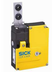
actuator not supplied with delivery

Note: The actuator has to be ordered separately. See "Accessories" for further details.