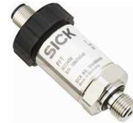
Product may differ from illustration