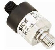
Product may differ from illustration