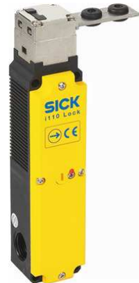
actuator not supplied with delivery

Note: The actuator has to be ordered separately. See "Accessories" for further details.