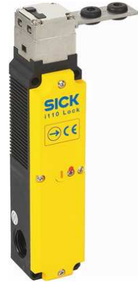
actuator not supplied with delivery

Note: The actuator has to be ordered separately. See "Accessories" for further details.