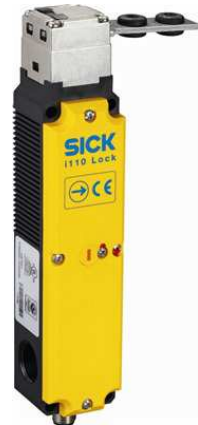
actuator not supplied with delivery

Note: The actuator has to be ordered separately. See "Accessories" for further details.