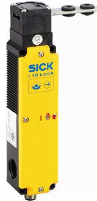
actuator not supplied with delivery

Note: The actuator has to be ordered separately. See "Accessories" for further details.