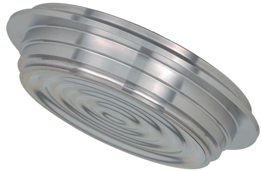
Diaphragm seal with sterile connection, model 990.24

The model 990.24 diaphragm seal with VARIVENT® connection is particularly suited for use in sterile processes and is