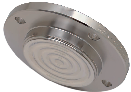
Diaphragm seal with sterile connection, model 990.60

For further technical information on diaphragm seals and diaphragm seal systems see IN 00.06 „Application, operating principle, designs“.