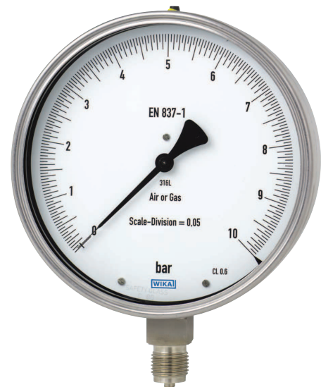
Test gauge series, stainless steel, model 332.50