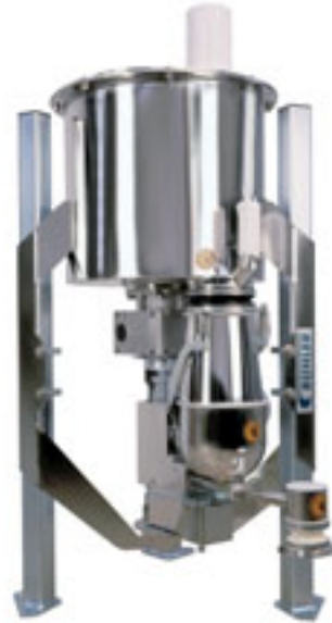
MSDF for gravimetric proportioning of micro-ingredients in a continuous product stream.

Whether free-flowing products at a low throughput capacity or non-free-flowing products with automatic refilling – Buhler offers you the right configuration, satisfying your process requirements accurately.